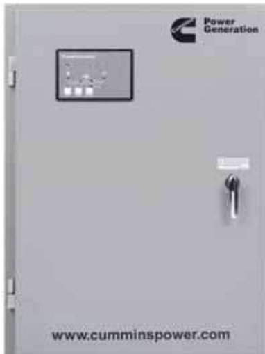
The above image is not to scale.