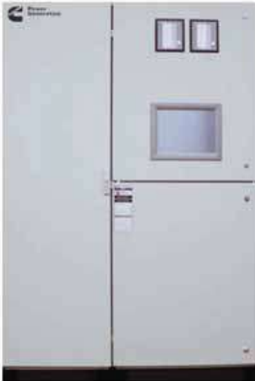
The above image is not to scale.