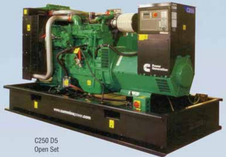
C250 D5 Open Set

A high quality product, coupled with unrivalled, reliability, gives industry leading power solutions.