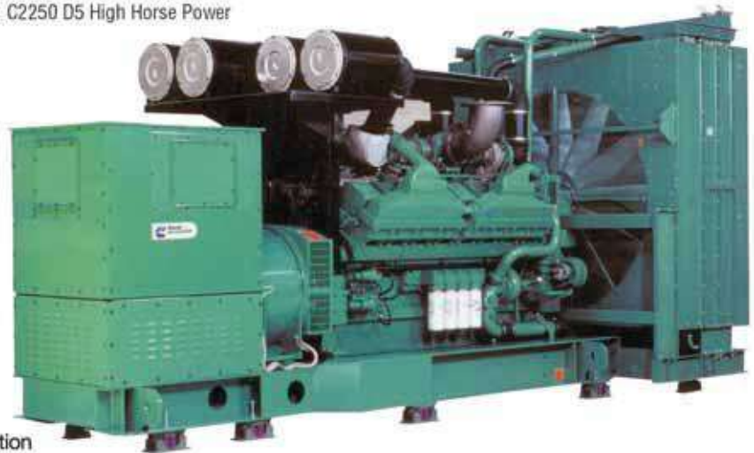
C2250 D5 High Horse Power