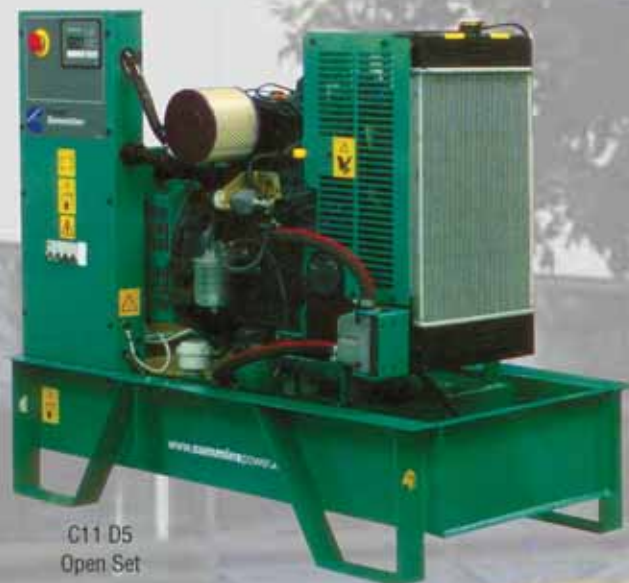
C11 D5 Open Set

500 company owned & independent distributorships 4,500 service and parts outlets